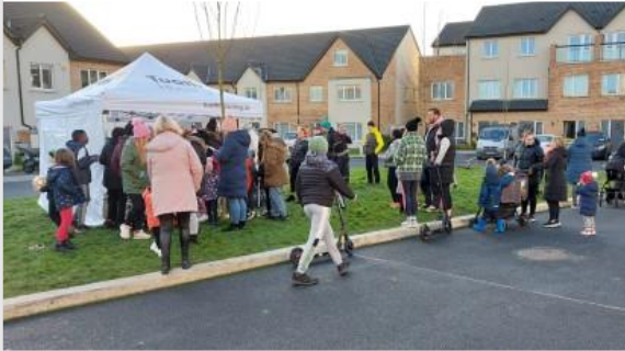
Christmas Celebrations at Dunville, Navan.

Sincere thanks to Four Star Pizza in Navan for their support of the Christmas celebrations for residents at Dunville, Navan, Co. Meath.